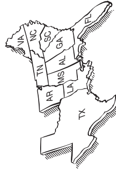
The Confederate States of America