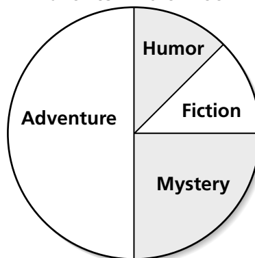
Favorite Kind of Book

If you have any questions or comments, please call or write to me.